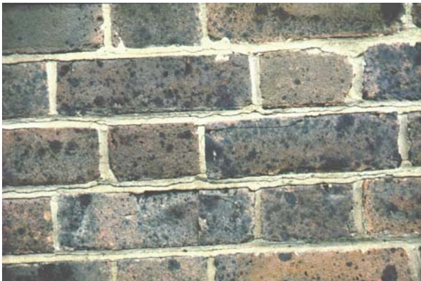
Cracking of the bed joint mortar is characteristic of sulfate attack.

Examples of serious deterioration of brickwork, due to sulfate attack, such as crumbling and erosion of the mortar joint or, in severe cases, expansion, bowing