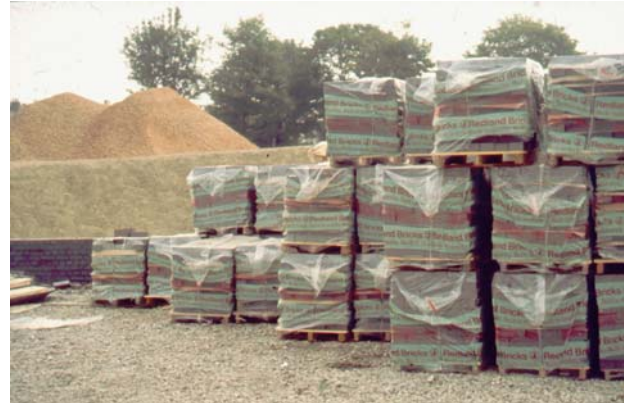
Bricks in a stack protected from saturation. They should preferably be stacked on boards or pallets and protected from splashes by vehicles.

There is little experience of the successful use of any admixture intended to provide frost protection by depressing the freezing point of the mixing water. Some substances that might be contemplated for this purpose (e.g., ethylene glycol) are known to adversely affect the hydration of the cement.