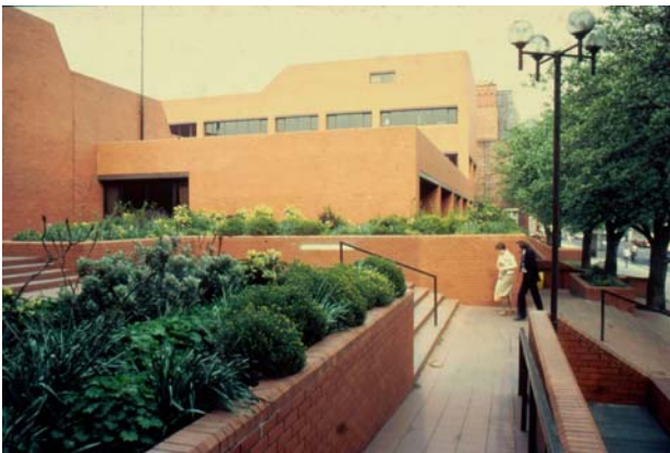
Flush cappings do not protect bricks below from saturation. Cappings and bricks must, therefore, be frost resistant.

A continuous sheet dpc should be provided beneath jointed copings and cappings, in order to prevent downwards percolation of water into the wall should the joints fail. The dpc will normally be positioned immediately underneath a coping. With a capping, in order to obtain greater mass above the dpc, it may be positioned one or more courses lower down. The risk of a coping or capping being displaced will be minimised by the use of a dpc designed to give a good bond with the mortar. Dpc may be omitted if coping is jointless.