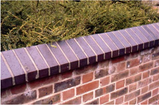
Clayware coping units with a suitable drip are functionally efficient and aesthetically pleasing.