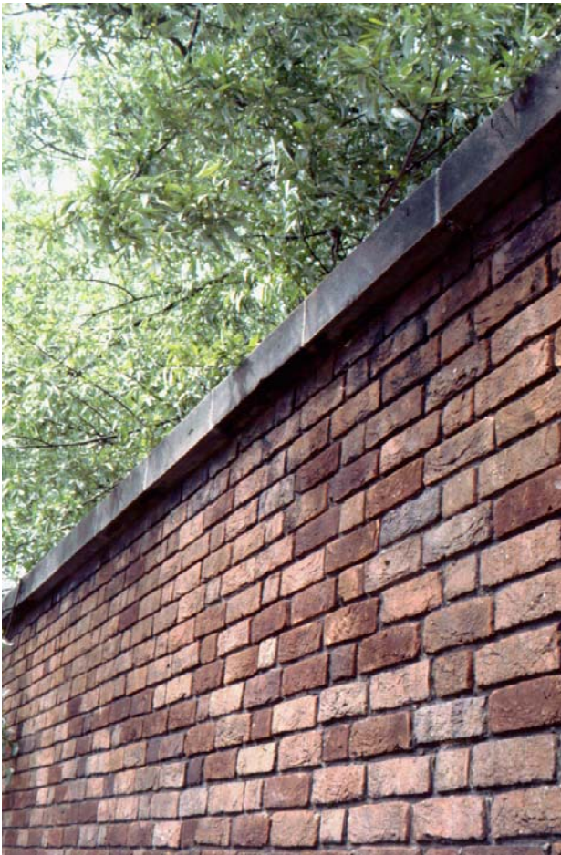
An attractive wall with an effective coping