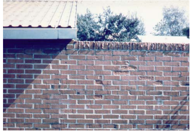
Frost resistant category F1 clay bricks are suitable in the external walls of buildings where protected from saturation. If the protection is omitted, saturation and frost damage may result.