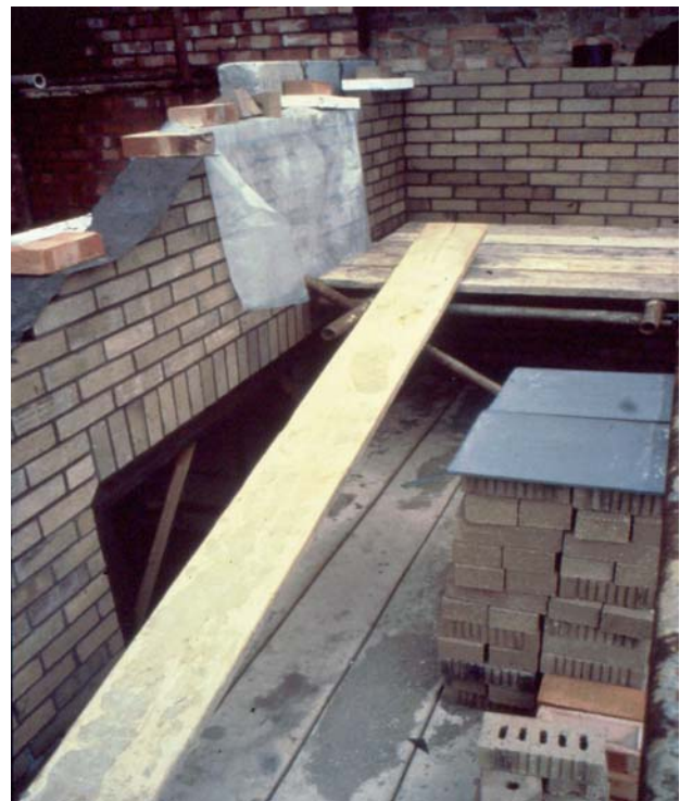
The protection of new brickwork and materials minimises damage due to saturation.